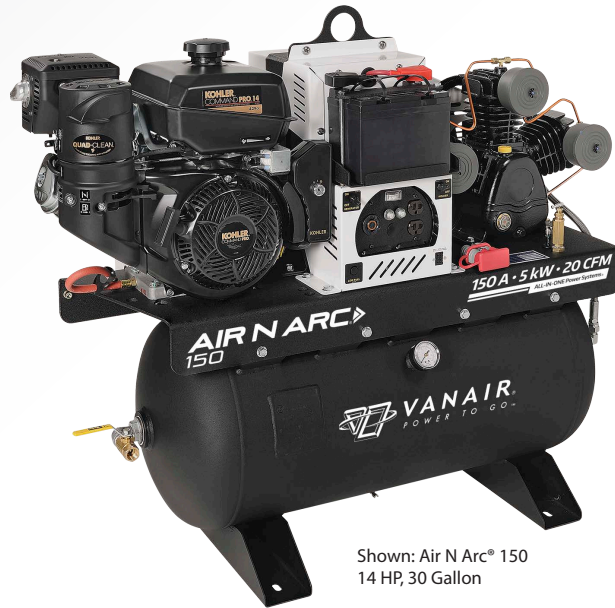
Shown: Air N Arc® 150 14 HP, 30 Gallon