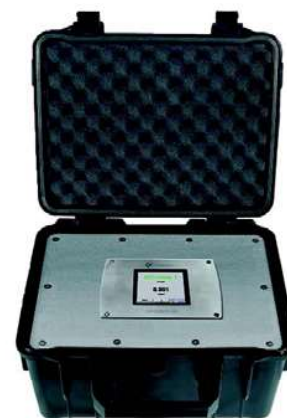
DESCRIPTION ORDER NO. Replacement OIL CHECK 500 for the period of re-calibration 0699 3930 Pre-calibrated sensor unit for the OIL CHECK 500, incl. certificate 0699 8080 Re-calibration OIL CHECK 500 incl. certificate 0699 3405 As-Found-Data OIL CHECK 500 with certificate 9999 3501