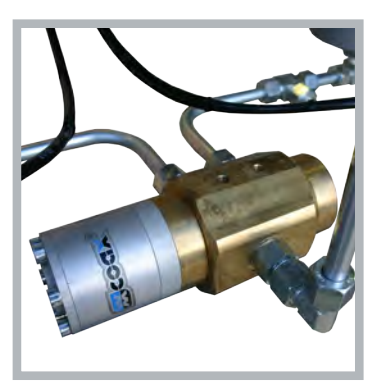
Rugged and reliable control valves

Provides a remote alarm signal for differential pressure across the pre or after filters.