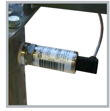
Optional dew point demand system