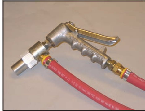
SG 300 - Portable Blast Gun with Hopper